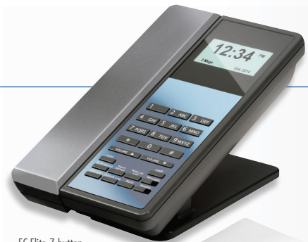
EC-Elite 7 button

Created for cruise lines and other properties with limited space, EC Series telephones are amazingly big on features, yet surprisingly small in size. Available in one- or two-line models, in analog or VoIP, EC Series phones feature up to seven guest service keys.