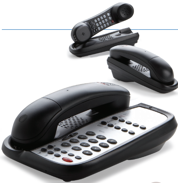
AC8210 (DECT 6.0)