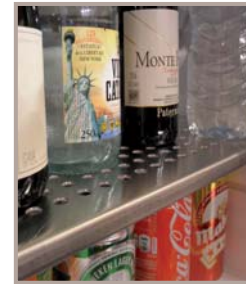
✓ ALUMINIUM TRAYS