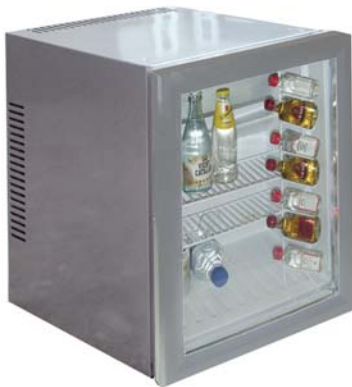
✓ GLASS DOOR