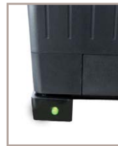
✓ OPENING CONTROL LED