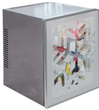
✓ CUSTOMIZABLE GLASS DOOR