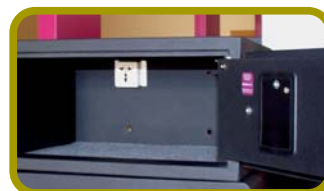
WIDE OPENING door