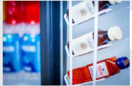
Bottle rack attached to door