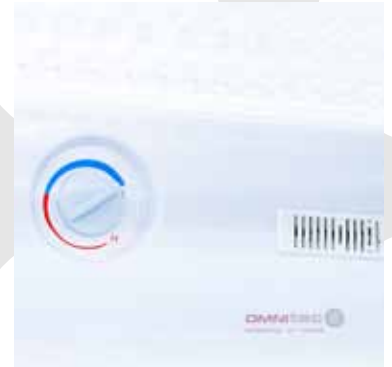
Interior Controller Temperature