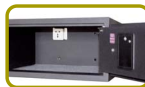
WIDE OPENING door