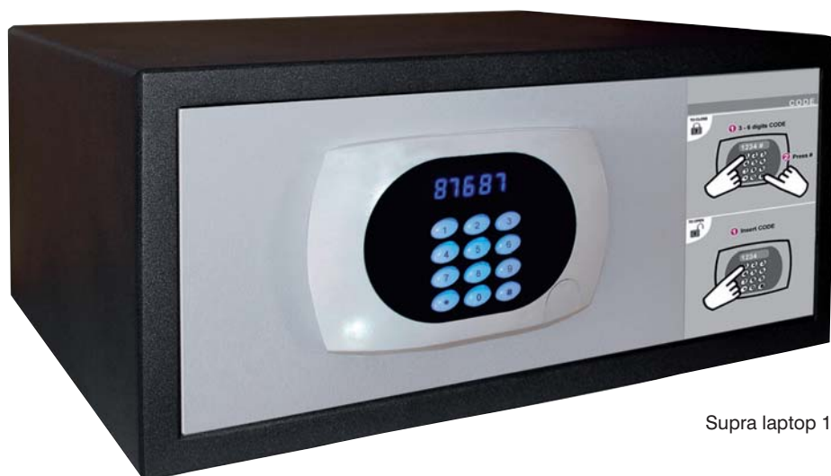
Supra laptop 15